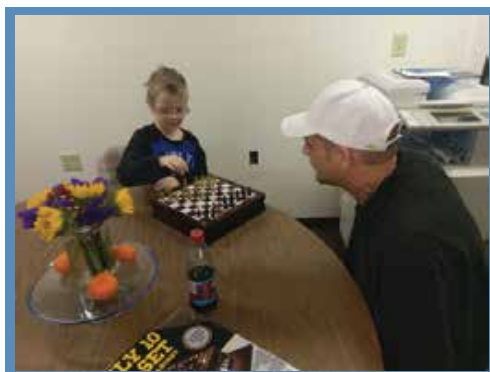
FPAC guests at the Day Center: son learning to play chess from a very encouraging father.