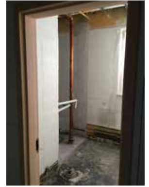
Left: Ava stands in her soon-to-be office. Right: A view of the future shower (this wall is now closed off)